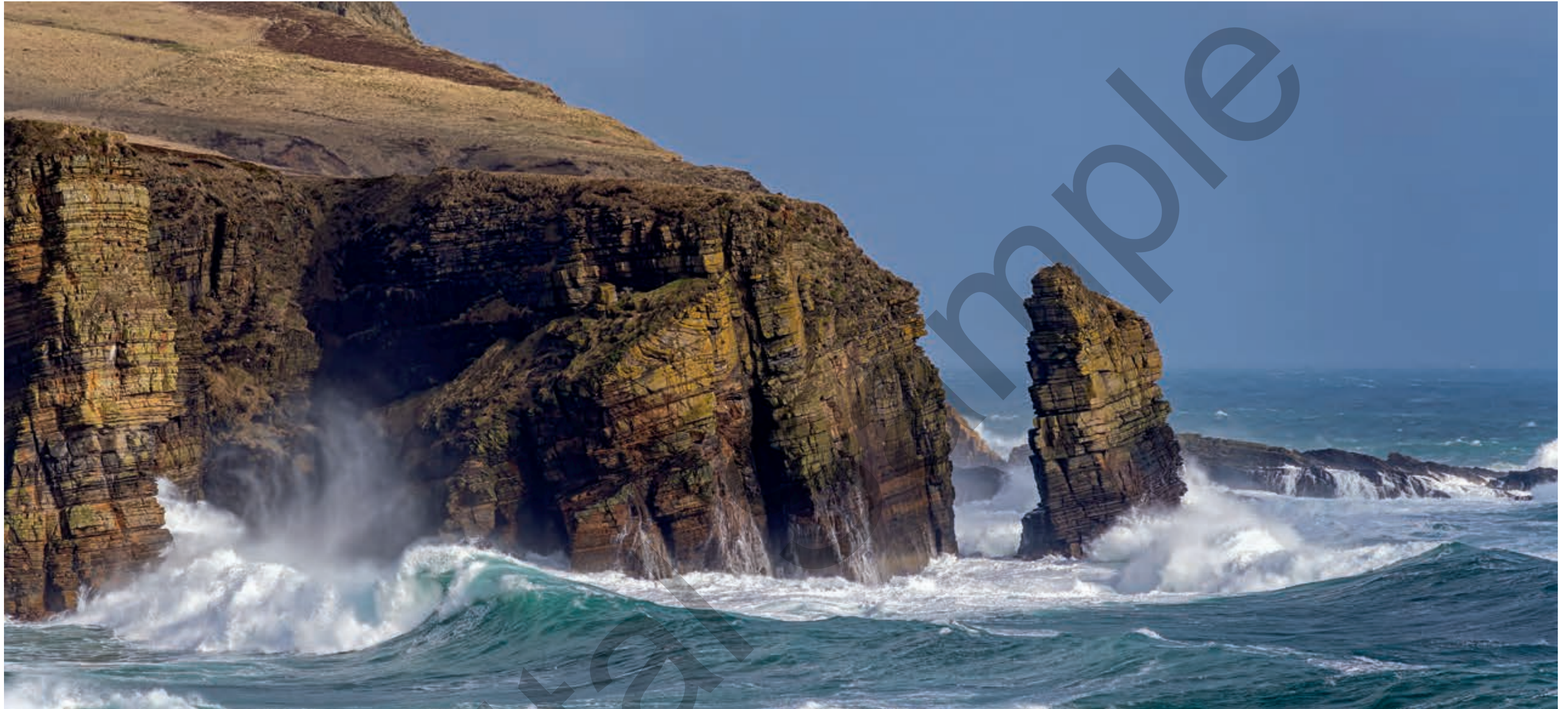
Clett of Crura, Wind Wick, South Ronaldsay, Orkney