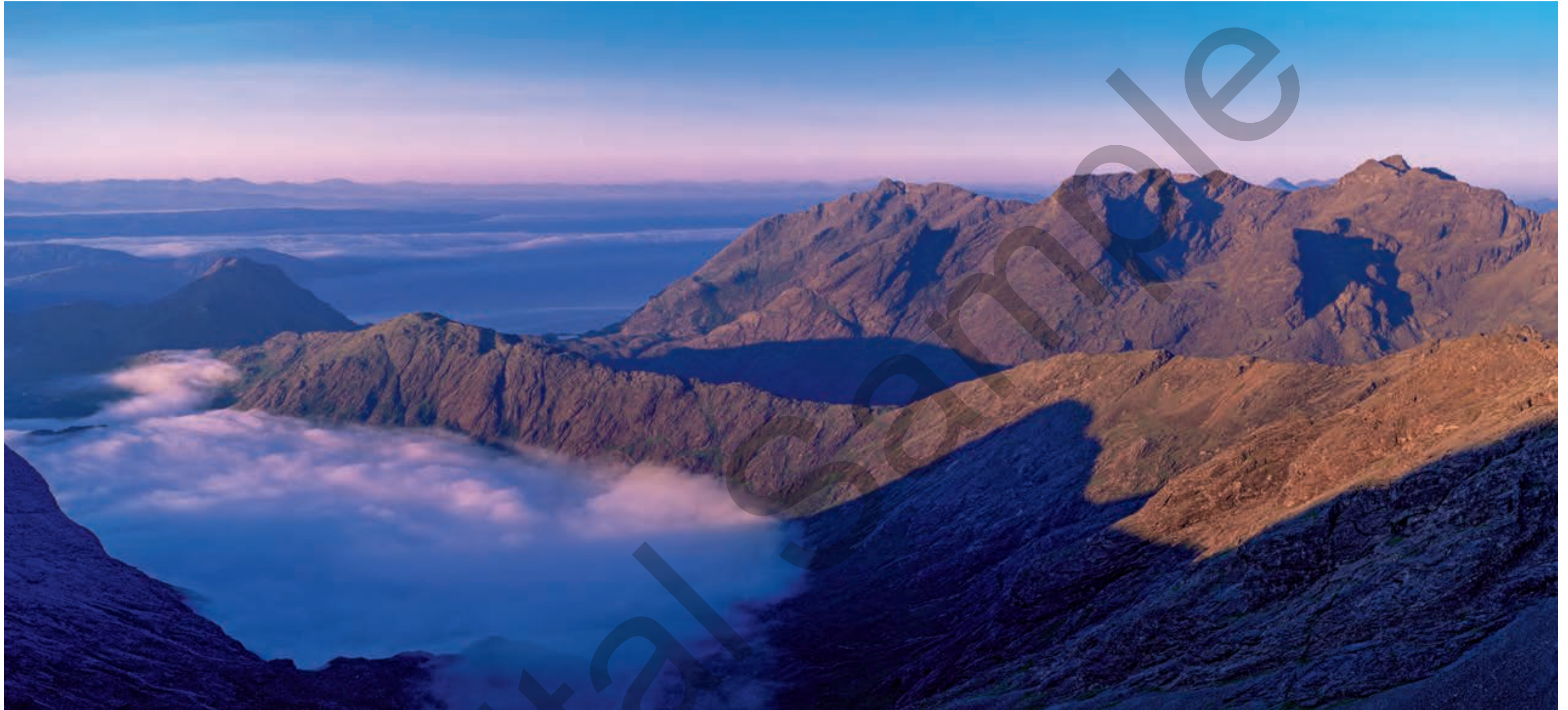
Sgùrr Dearg and the Inaccessible Pinnacle, Sgùrr Alasdair and Sgùrr Dubh Mòr, Cuillin, Isle of Skye