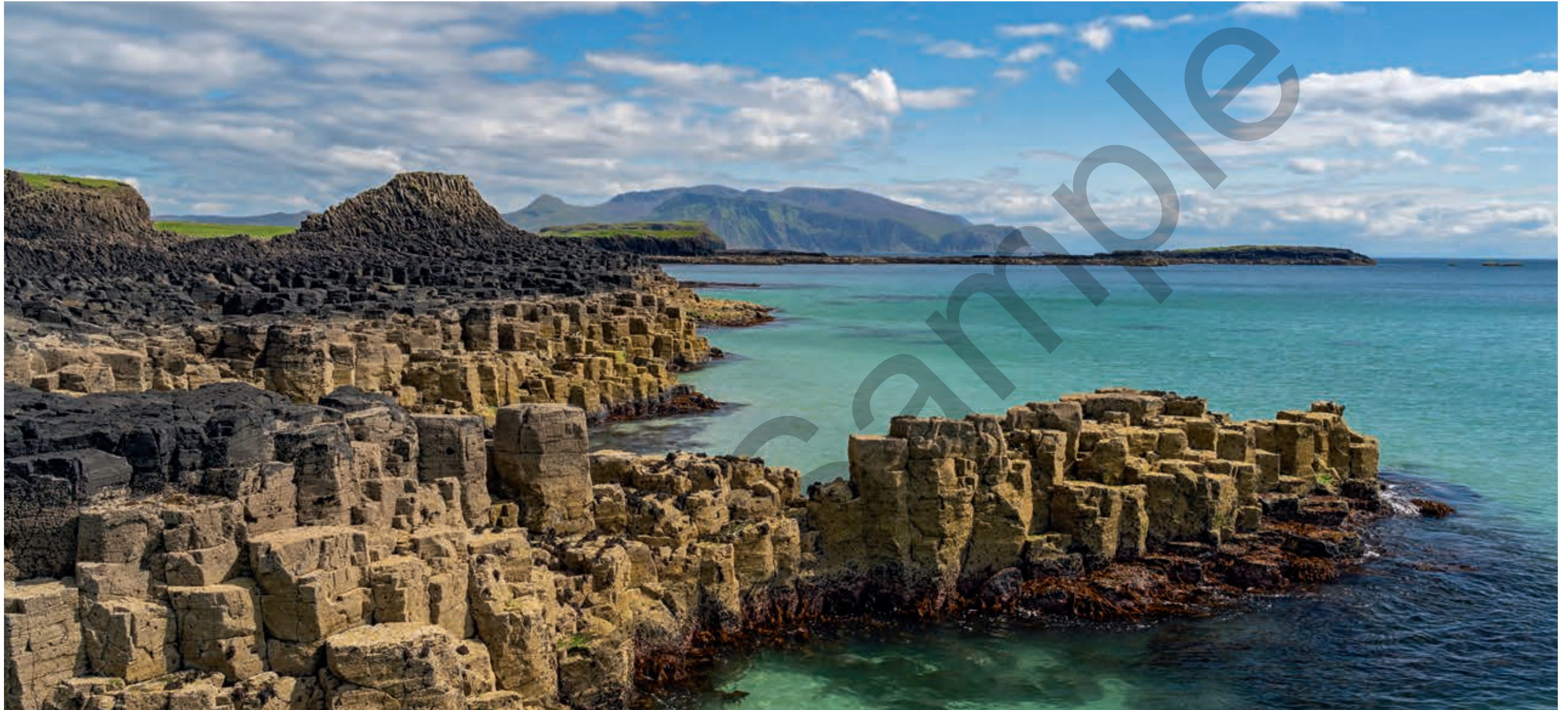
Isle of Sanday and Rum from Isle of Canna