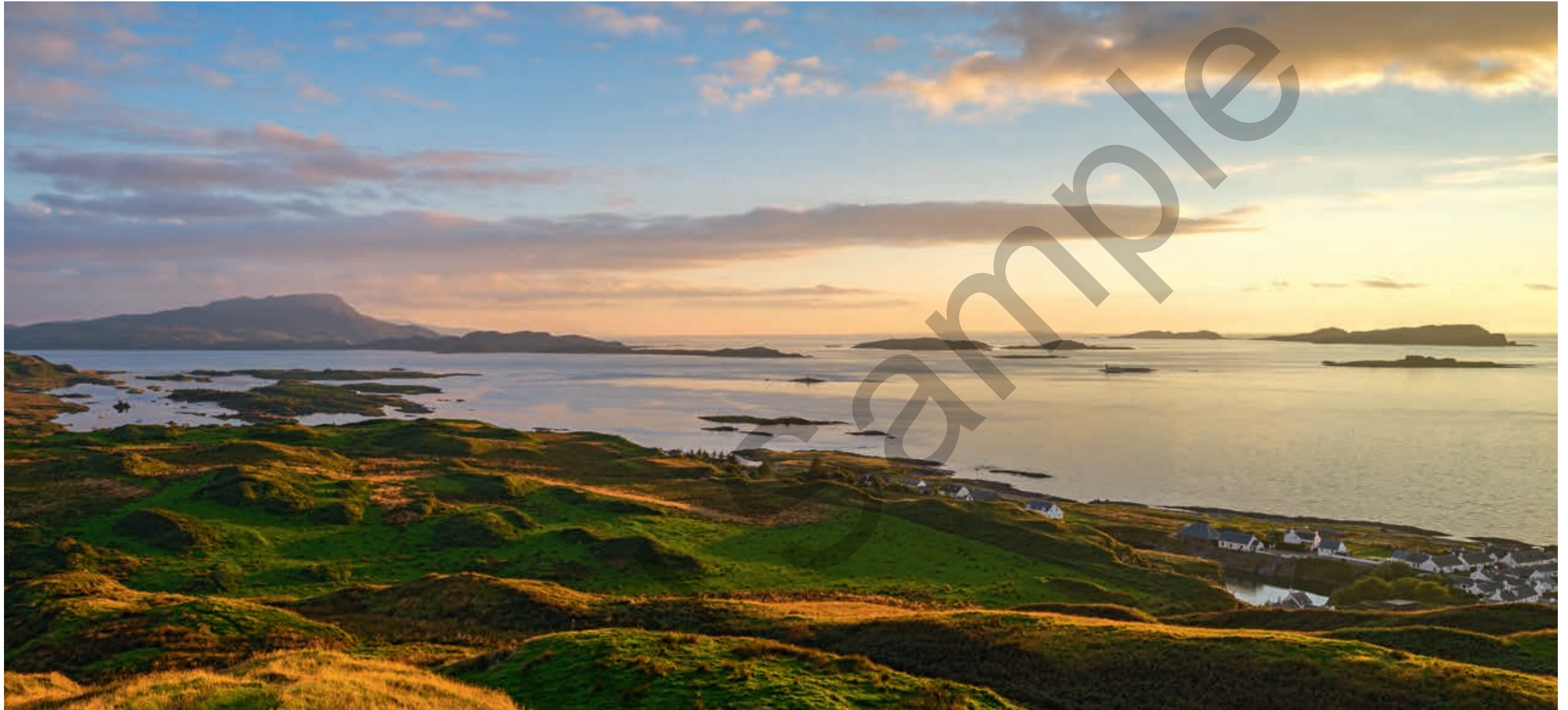
Scarba, Lunga, Eilean Dubh Mòr, Flada, Belnahua and the Garvellachs, Sound of Luing