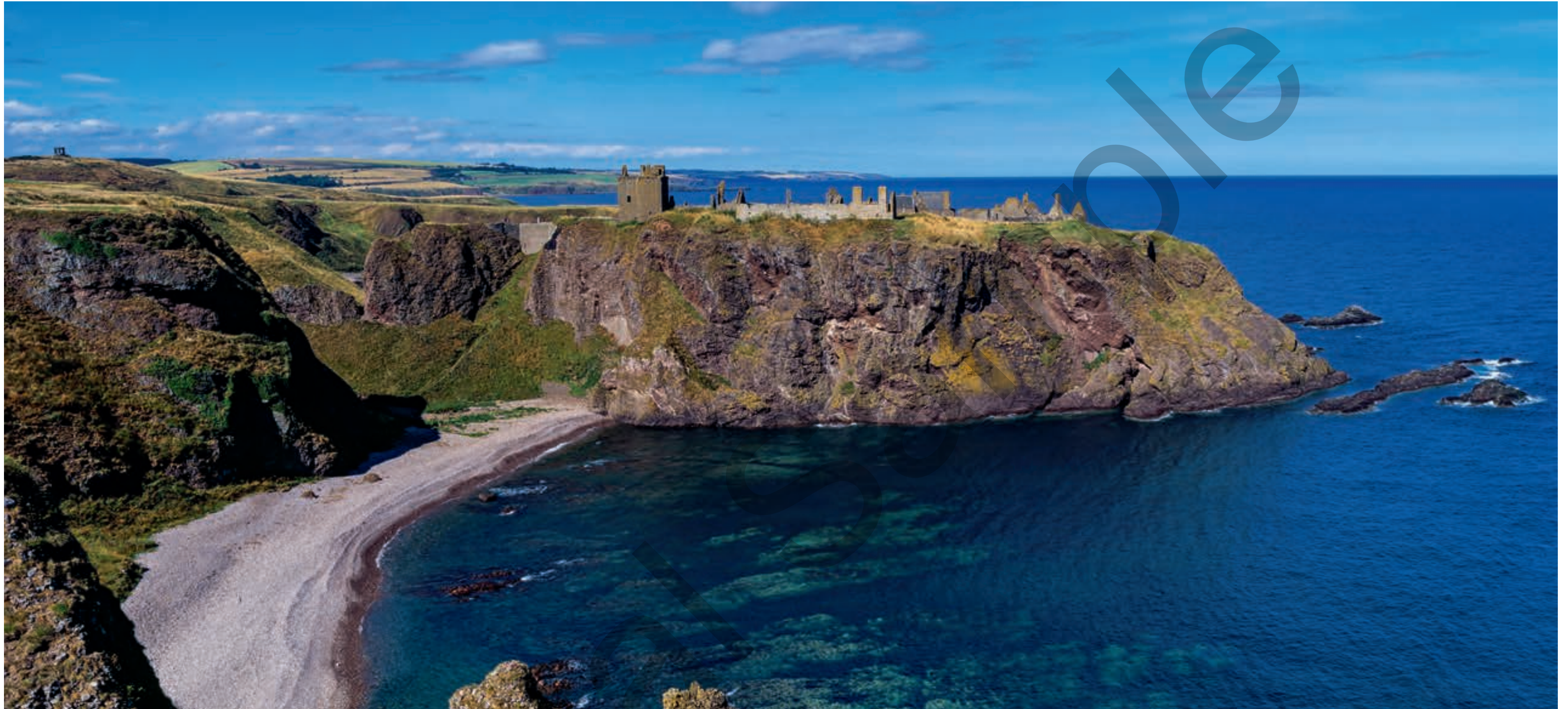
Dunottar Castle, Old Hall Bay, Stonehaven