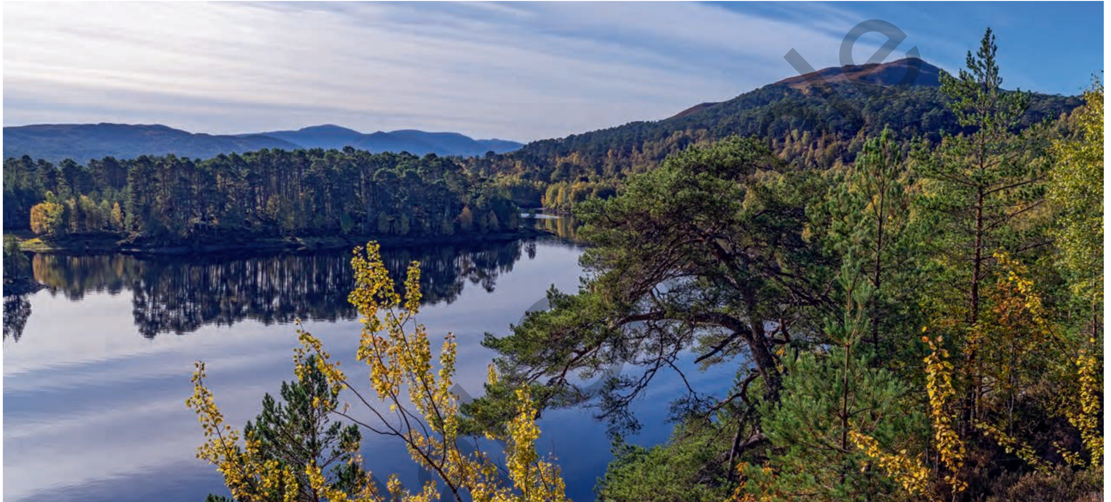
Loch Beinn a' Mheadhoin, Glen Affric