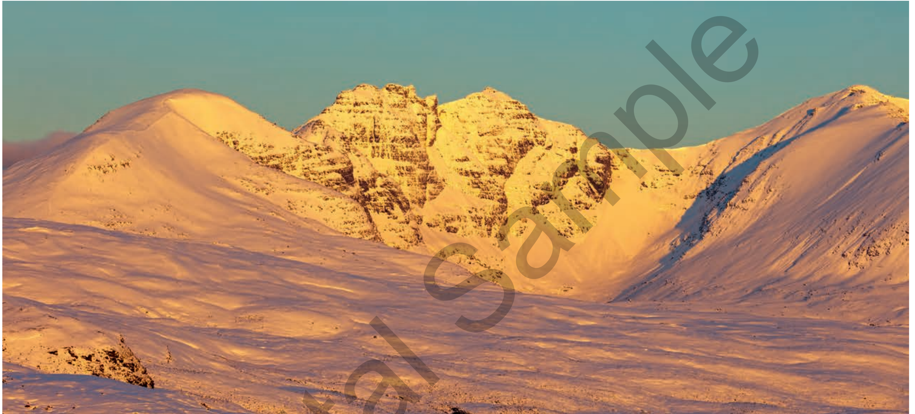
An Teallach: Corrag Buidhe, Lord Berkley's Seat and Sgùrr Fiona, Fisherfield Forest