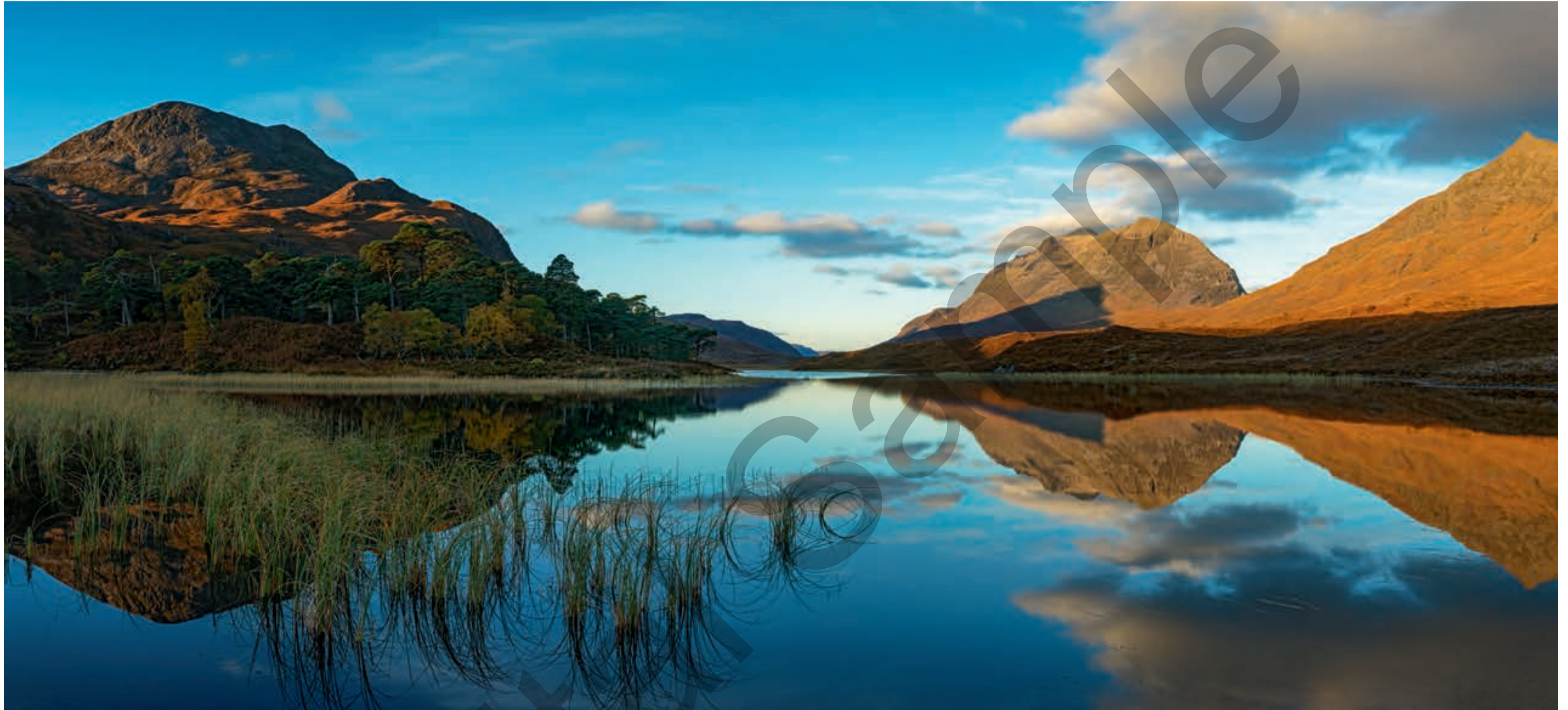
Creag Dhubh and Liathach, Loch Clair, Glen Torridon