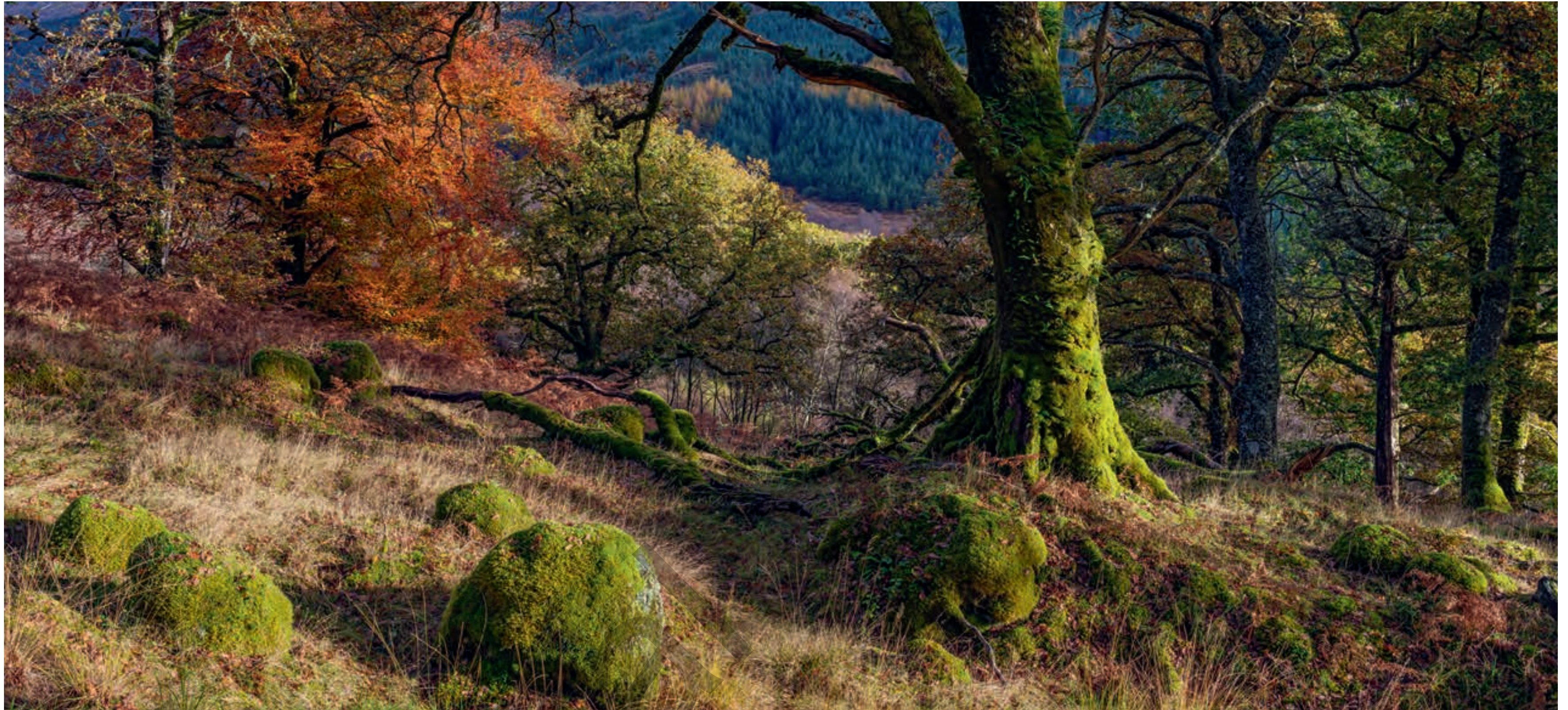
Ariundle Oakwood National Nature Reserve, Strontian, Ardnamurchan