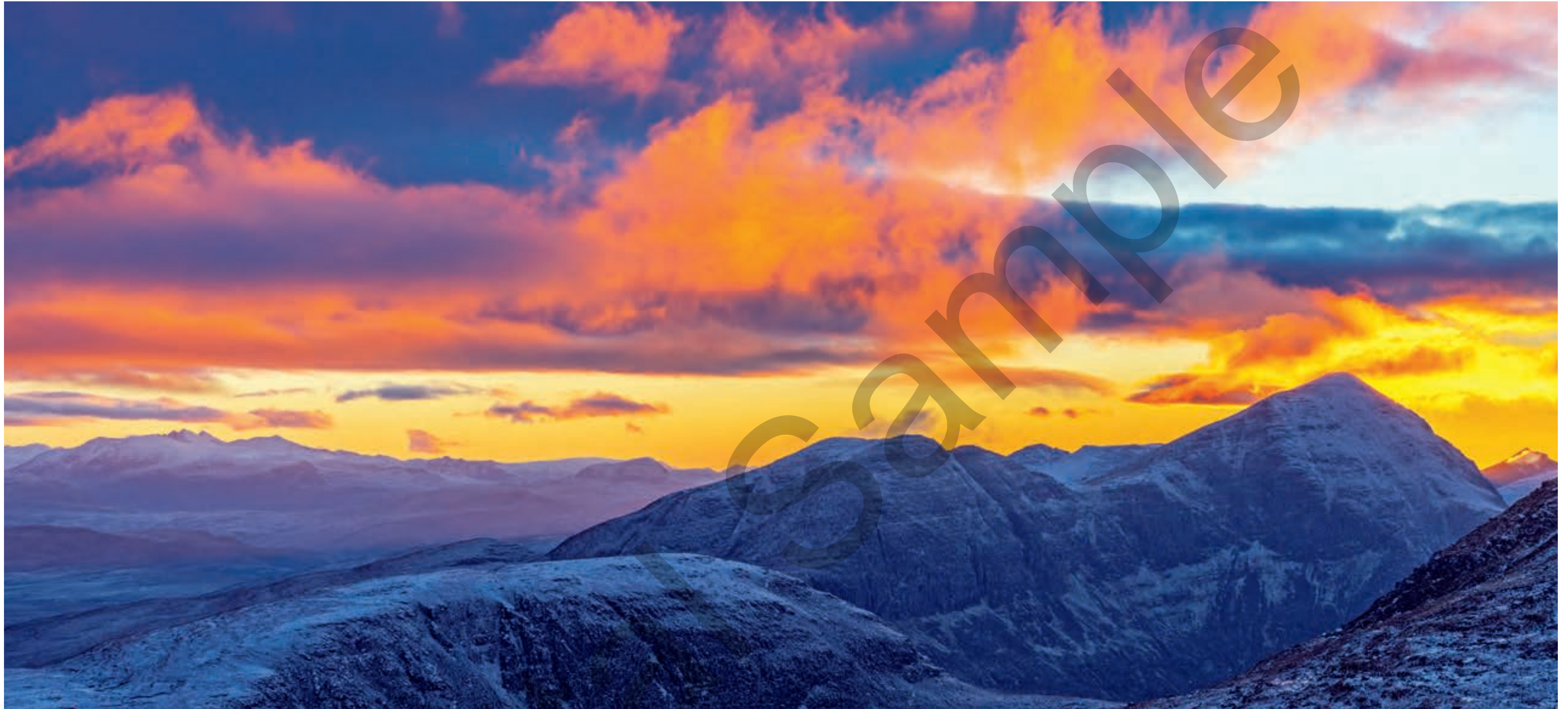
An Teallach, Cùl Beag and Sgùrr an Fhìdhleir, Assynt