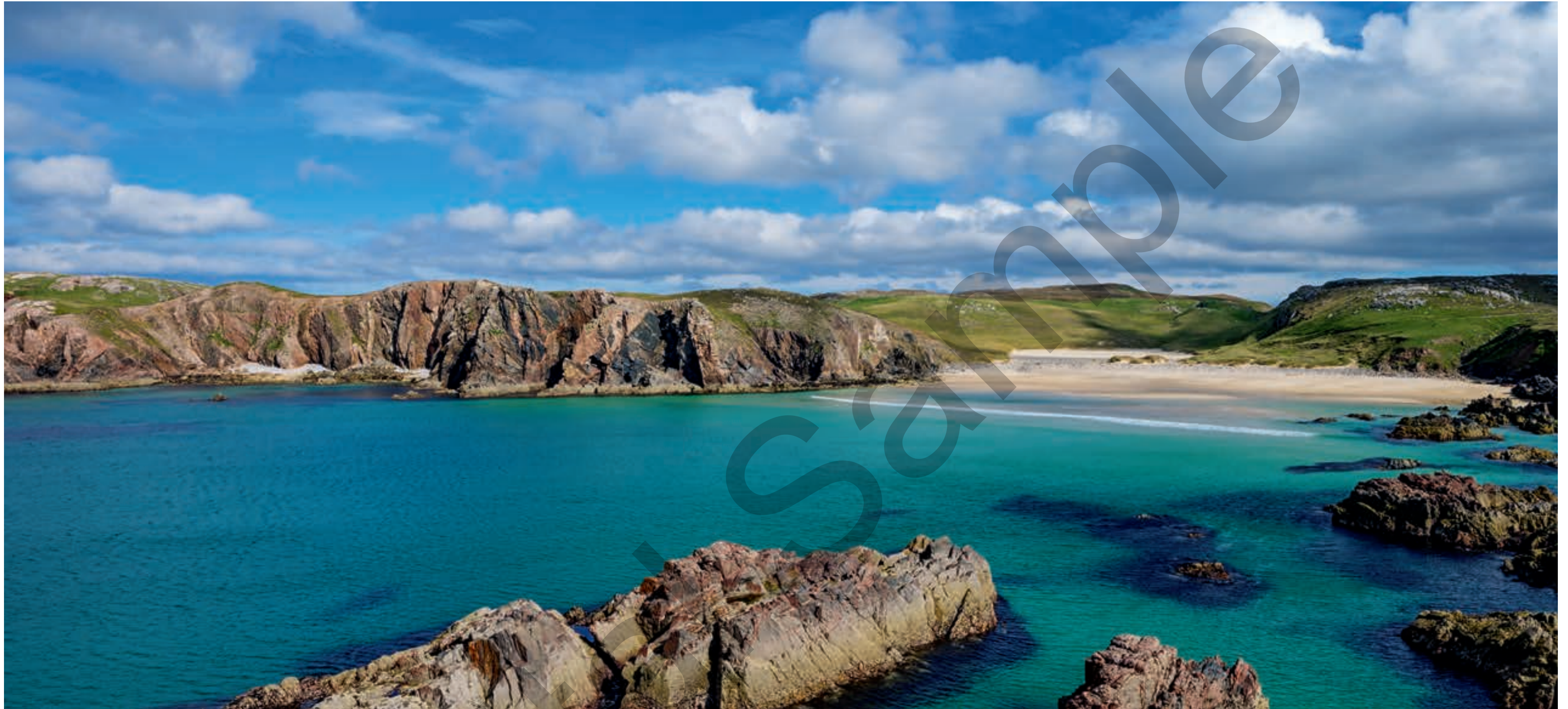
Tràigh Mhangarstaidh, Isle of Lewis